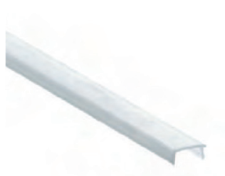
Diffuser - D