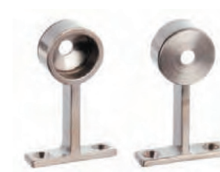
Side Support - SS