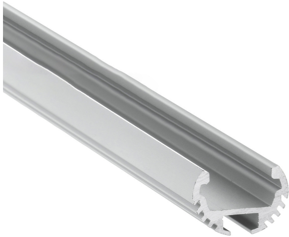
Garment Rail - GR

Our Garment Rail led profile is manufactured with high purity aluminium and available in anodized silver, lacquered white and raw aluminum.