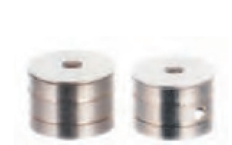
Side Connector - SC