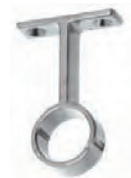
Centre Support - CS